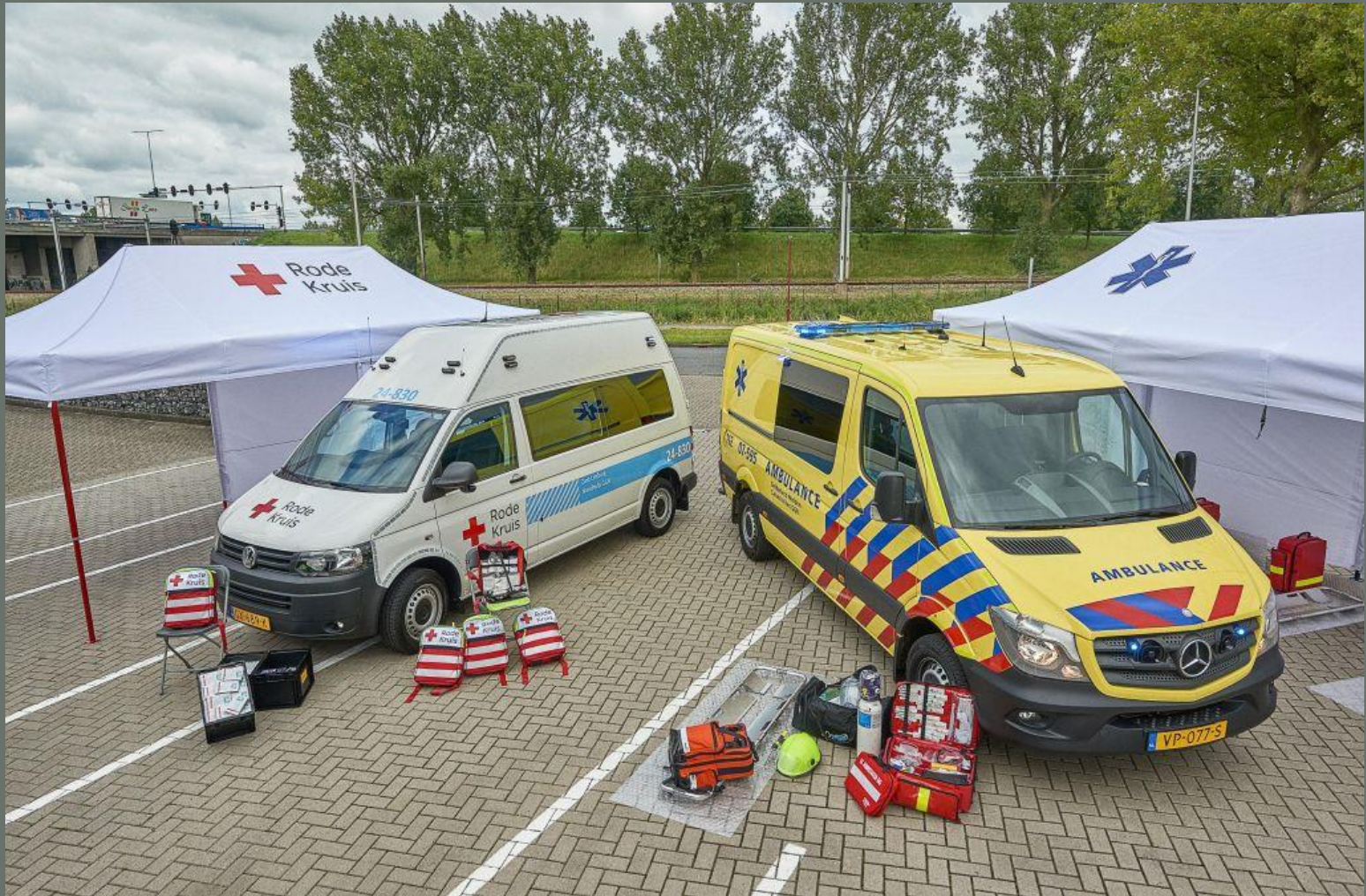
OTO LIMBURG VOORBEREIDING OP RAMPEN EN CRISES